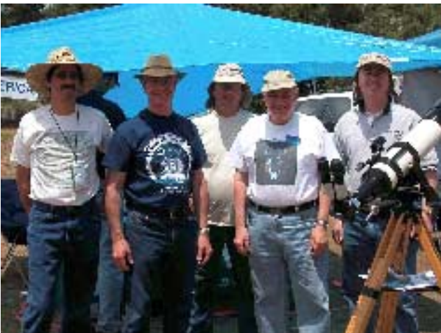
The AVAC gang who couldn't see straight.