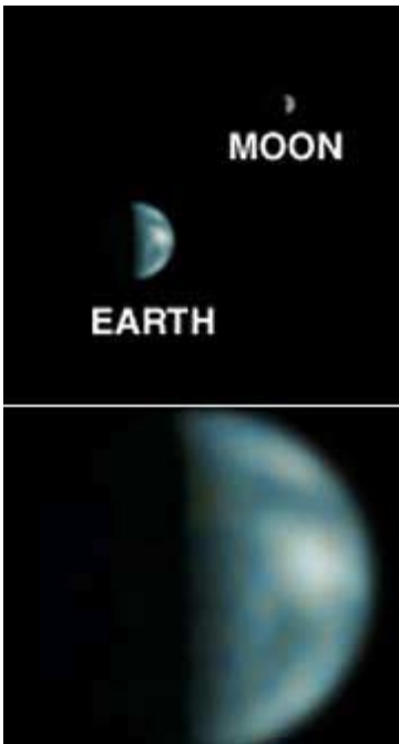
The first shots of Earth from our neighbor, Mars