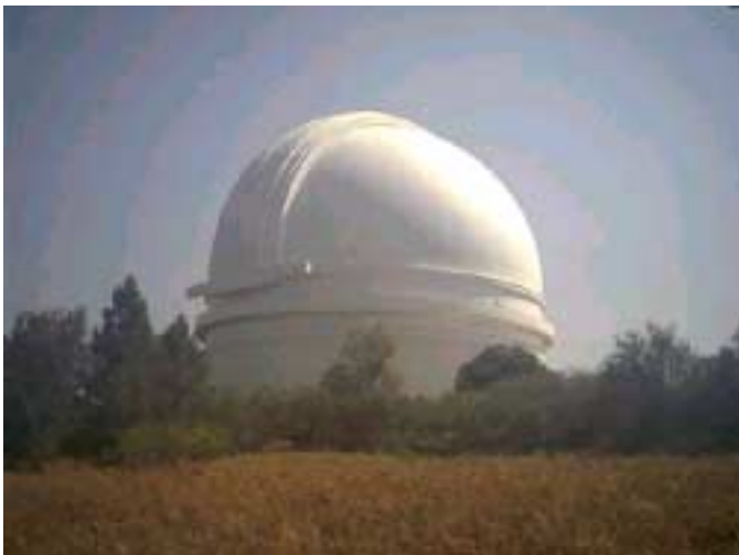
The famed Palomar Observatory.

Please do not miss these opportunities to make a difference. Trust me, the rewards will be yours. Until then-take good care.